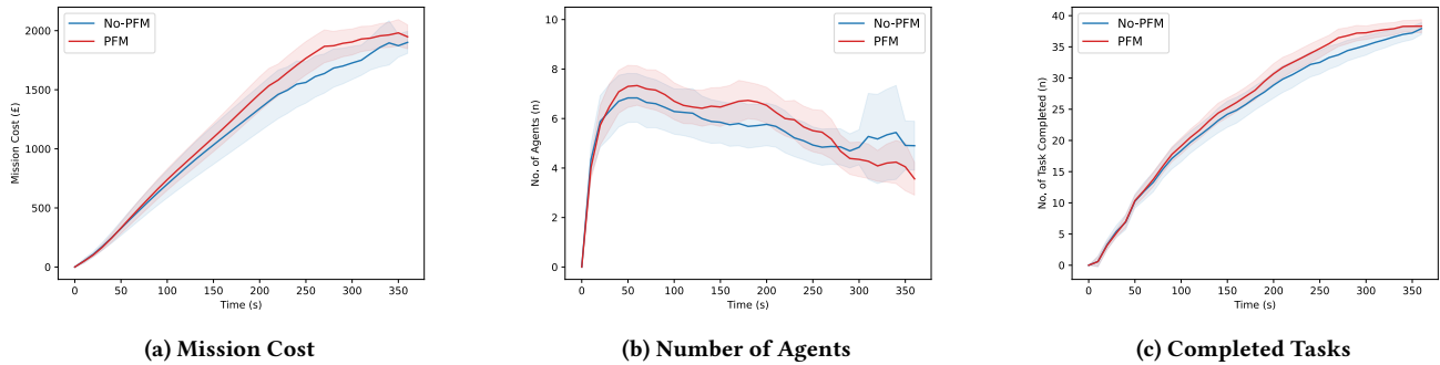
Figure 2: Comparing the mean performance over time. The shaded region around the mean shows the standard deviation.

Our dataset meets the prerequisites necessary for conducting one-way ANOVA testing. We performed a G*Power analysis to verify that our sample size aligns with the required criteria. With N = 60 across experimental groups, an assumed effect size of 0.2, and a significance level of 0.05. The G*Power analysis confirmed that our study is adequately powered to detect the expected effects.