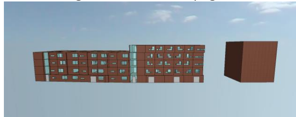
Figure 2.1: Geometrical Model in IESVE®-Model Viewer™

The thermal model was developed from geometrical parameters, materials, equipment and operational data of the CSB using ModelIT™, ApLocate™ and Apache™ modules in IESVE®. The model had 260 spaces grouped according to storeys and activity functions, 72 construction, and 19 thermal templates. A pictorial view of the IESVE® model is shown in Figure 2.1. The structure right side of the model is an adjoining building, considered a topographical shade in the model. The end of the building to the left of the page is the North-end.