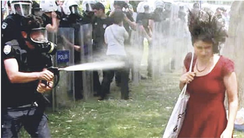
Figure 1. Woman in red.

We recognise that the protestors at Gezi Park were neither artists nor dissidents. However, similar to them they appealed to aesthetic expression with everyday references in order to become more expressive and generate audiences for their activism. This is how they appropriated pepper gas, detaching it from its weapon quality but instead embraced it as a trigger to protest. Pepper gas was not the motivator of the Gezi protests but helps to explain what sustained or nourished the protests after it began. As protestors saw how pepper gas was being deployed indiscriminately by the authorities, pepper gas came to symbolise the excessive force of the state, indeed, that the government was actively attempting to silence the voice of the people. This was realised in one of the most widely circulated images of the Gezi protest on social media, the ‘lady in red’ (see Figure 1) that shows a random non-violent woman in a red dress being sprayed with pepper gas at close range by a policeman. This image came to symbolise arbitrary police violence as well as gendered violence by the Turkish state that galvanised even apolitical people to join the protests. In reflection, we state that the dissidence against authoritarian repression in both Turkey and communist Eastern Europe is comparable inasmuch as the dissidents in both turned to creative media and outputs to seek audiences and affect those who may otherwise remain apolitical.