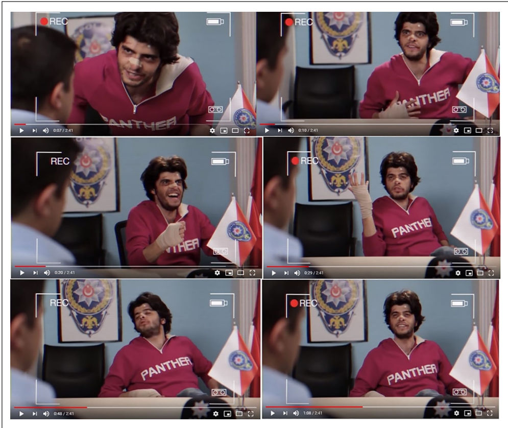
Figure 7. Gaz var mı, Gaz?

humour as this parody refers. This is what contextualises this video in the theatre of absurd. Turkish humour is replete with references to people finding themselves in situations at police stations following raucousness after a night out drinking alcohol or domestic violence. To being at a police station and its everyday quality – characterised by humour in this video, the activist introduces the pepper gas and presents it as a disturbance to the order of things. As in the earlier instances, rather than pacifying the activists, thereby, the pepper gas has activated him. After he saw the commotion at Gezi Park on Twitter and how the protestors were gassed, he says, he rushed to Gezi Park asking to be gassed. He adores gas and he is aware that his adoration metaphorically presents a threat to the status quo. In a nutshell, his simple movements of everyday gestures enrich his experience of the pepper gas and his protest as a result.