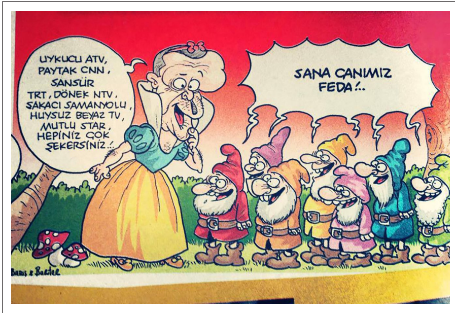
Figure 2. Erdoğan and the seven dwarfs.

‘laughing together’ (Demjén, 2014; Fraley and Aron, 2004). Furthermore, colloquialisms, phrases and expressions, what Olszewska (2005) called the ‘New Speech’ in the dissident Polish poet Baranczak’s work, can also represent socio-political and cultural situations within authoritarian contexts. The principal aim of Baranczak’s poetry was to speak the ‘truth’ about the political and social reality of the time. This new poetical expression incorporated exposing the language of propaganda by means of dissecting its structures, employing the linguistic concrete and situating the poem in the socio-political reality. In this kind of poetry, the official language was countered with irony and popular catchphrases, and used in order to draw the reader’s attention to the fact that the language of propaganda is devoid of meaning (Olszewska, 2005: 18–22). Therefore, metaphors, colloquialisms, phrases and expression composed the essence of ‘carnivalistic laughter’ as Bakhtin (1984 in Häkkinen and Leppänen, 2013) indicated earlier. The truth that such carnivalistic laughter provides rebuked the authoritarian regimes from fostering their own truths. We present two instances (see Figures 2 and 3) how the activists reflected on common knowledge, planted metaphors, played with language and overall used humour to build audiences in support of their platforms during the Gezi Park protests.