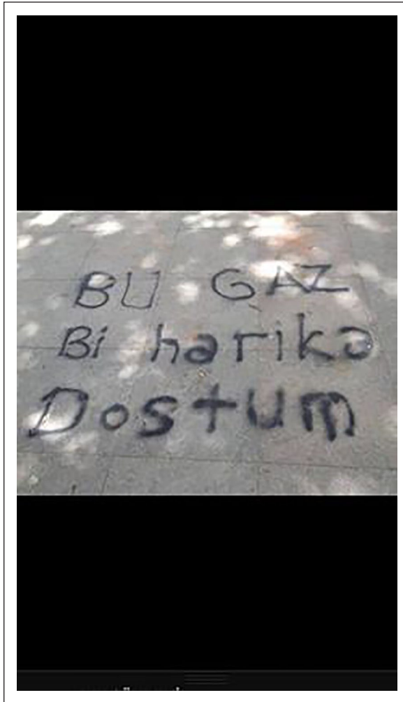
Figure 6. Mate, this gas is amazing!