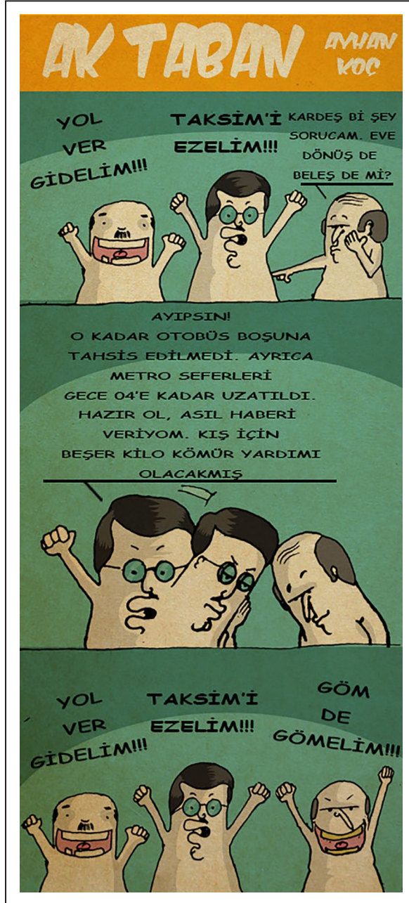
Figure 3. AK Taban.

the government provided free public transportation for its supporters in order to boost the visibility of the pro-government rallies held in Istanbul during the Gezi Park protests. It also refers to AKP's using in-kind assistance such as coal, wood or food items in order to co-opt supporters. The caricature is named AK Taban – the bedrock of AKP – in reference to AKP constituency.