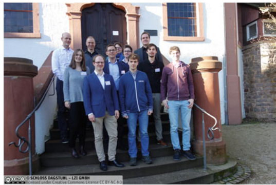
Fig. 4 The nominees and the committee in Dagstuhl 6

All nominated candidates and especially the winning person (or group) are invited to summarize their work in this book.