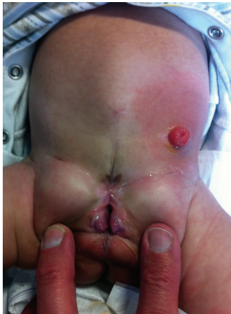
FIGURE 2: The appearance of the patient's abdomen after surgery in clinic at 8 weeks old. The end colostomy is visible along with the opening of the bladder neck and the hemiphalli.