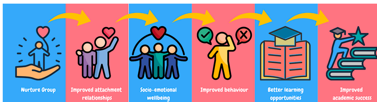
Fig. 1. Nurture Group theory of change.

Since publication of Hughes and Schlösser’s (2014) review, a number of studies measuring the effectiveness have been published, including two on secondary school Nurture Group provision and one large-scale evaluation. The aim of the current work, therefore, is to extend the work of Hughes and Schlösser (2014) by providing an update that includes the most recent evidence in the field. Specifically, our aim was to establish up-to-date and evidence-informed conclusions as to the extent