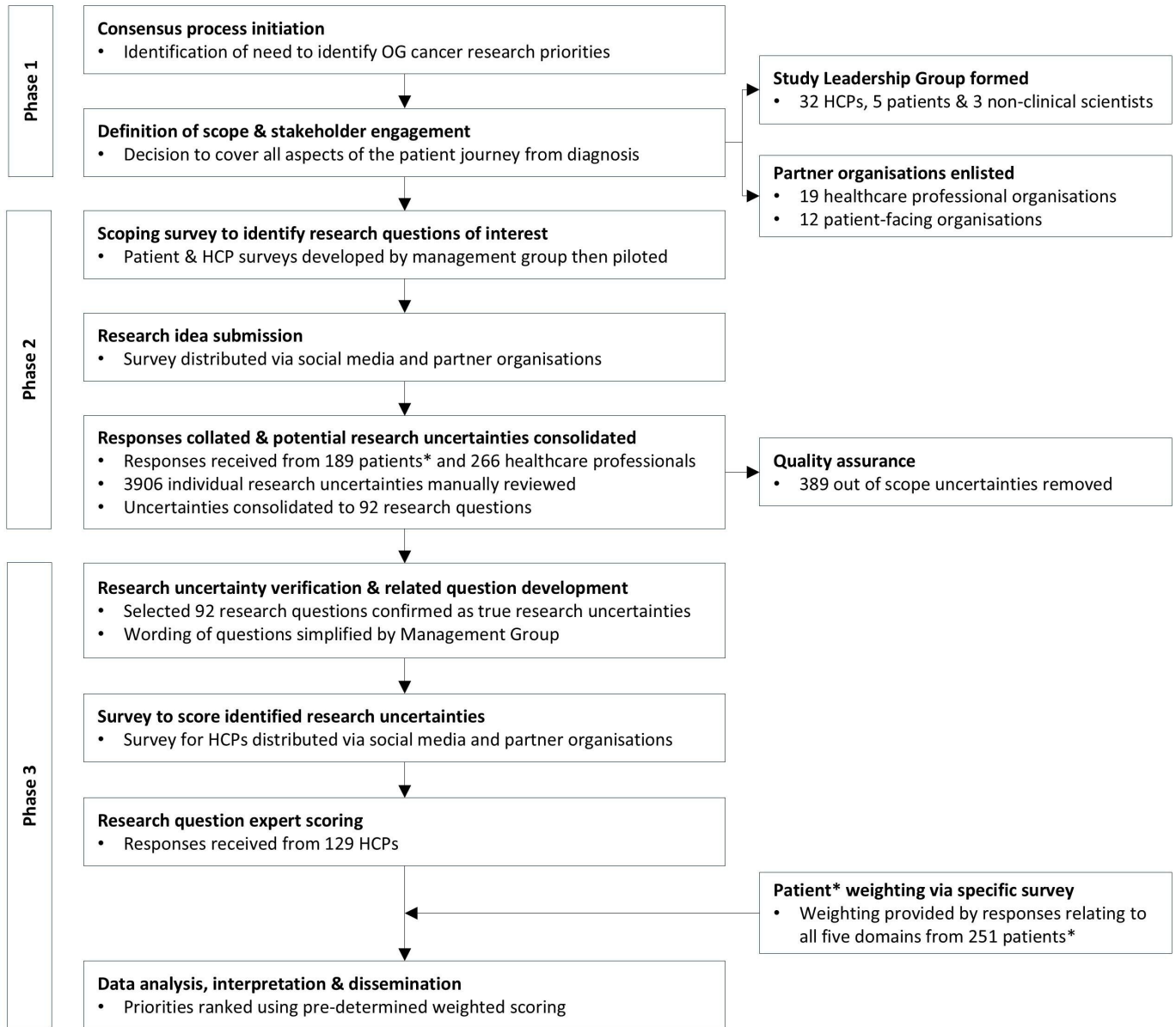
Figure 1 A summary of the process used to derive research priorities. *Patients refers to responses from patients, their carers and lay persons with an interest in OG cancer. HCP, healthcare professional; OG, oesophagogastric.